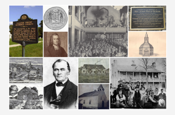
Preserving the past to prepare for the future!

The mission of the Evangelical and Reformed Historical Society is to stimulate and cultivate interest in the continuing legacy of the Evangelical and Reformed Church.